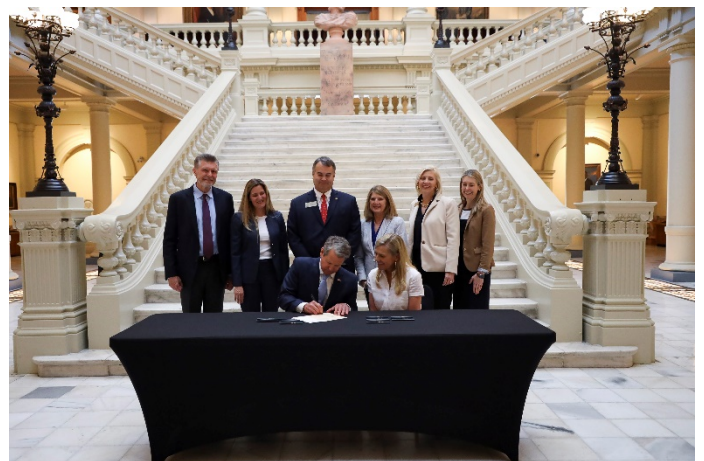
HB 80 bill signing